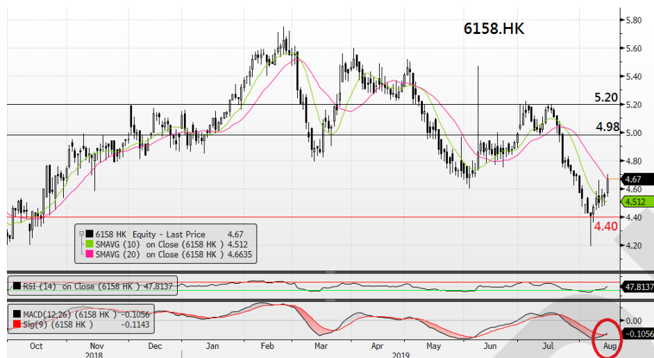
Chart by Bloomberg